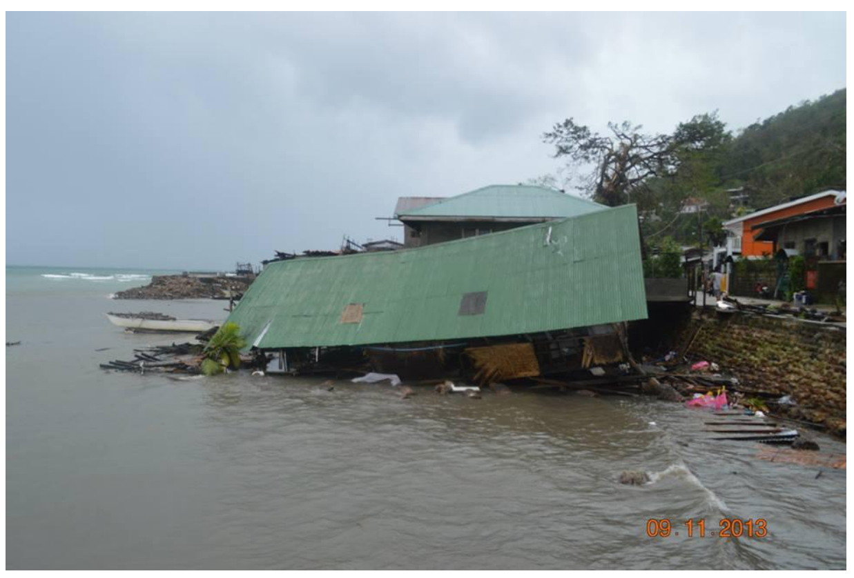
Images of Balala (up) and Jardin (down) in the aftermath of the typhoon in Culion.