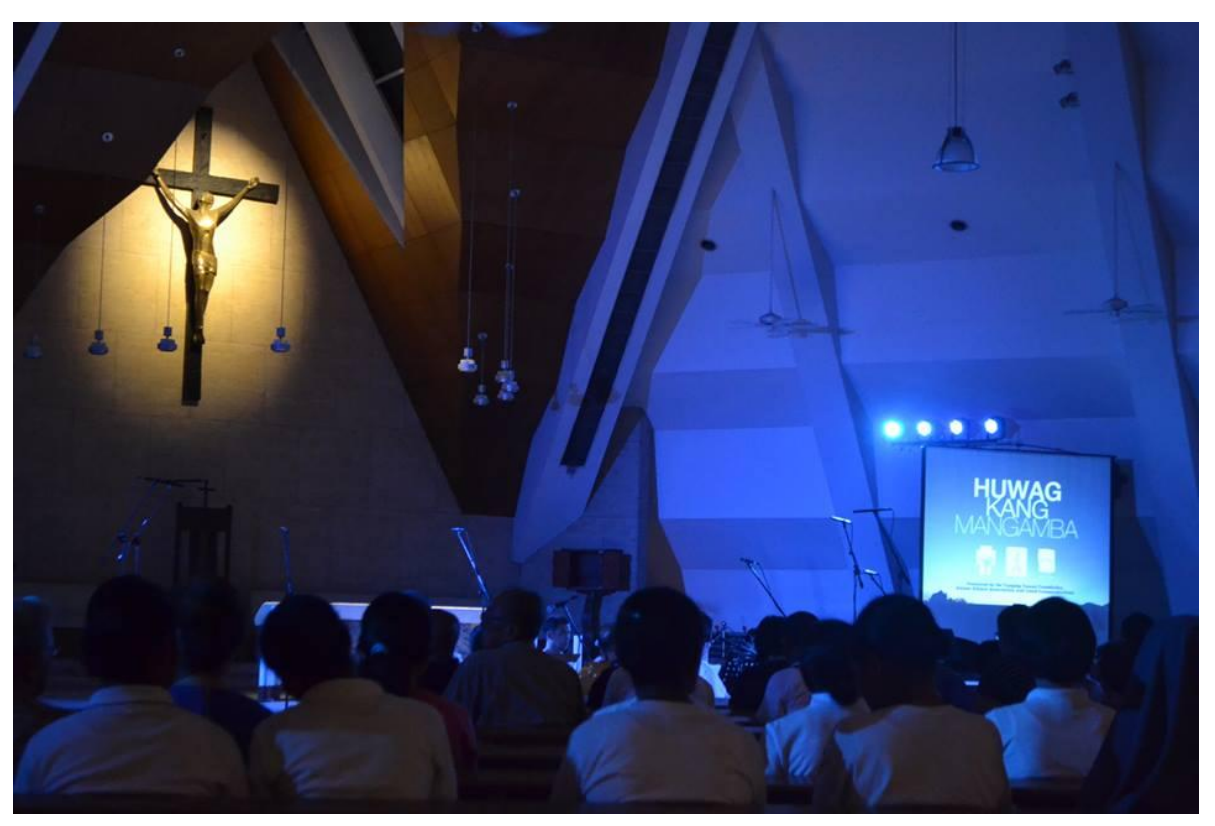
Huwag Kang Mangamba (Do not Be Afraid), a benefit concert for those affected by the typhoon, held at the Church of the Gesu, Nov. 27, 2013